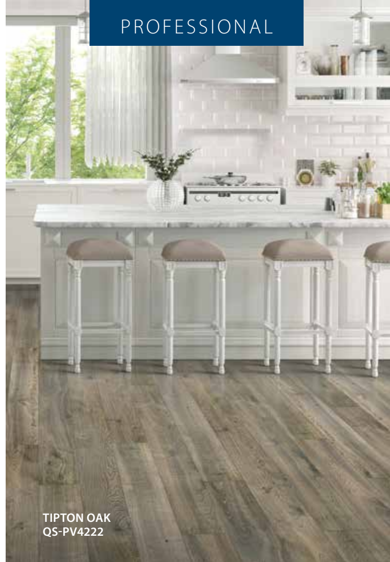
TIPTON OAK QS-PV4222