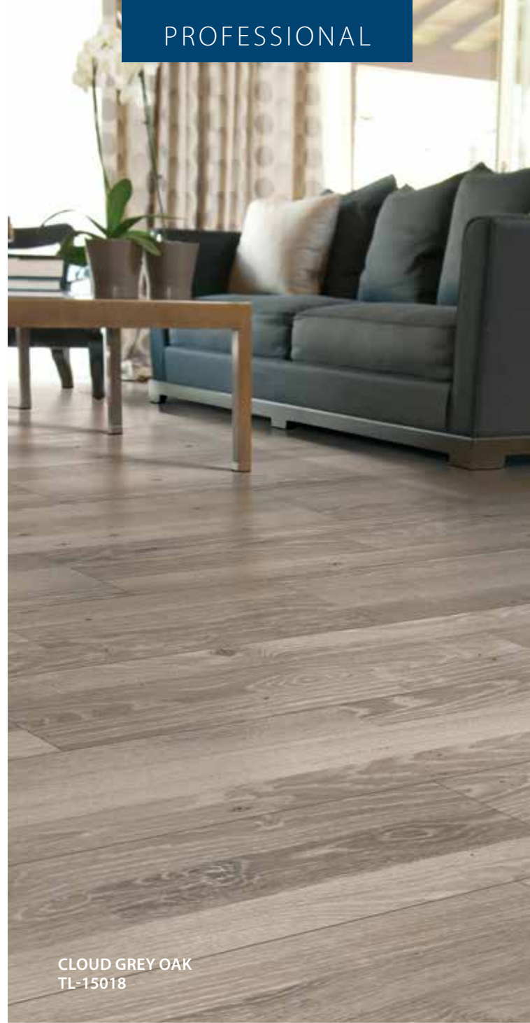
CLOUD GREY OAK TL-15018