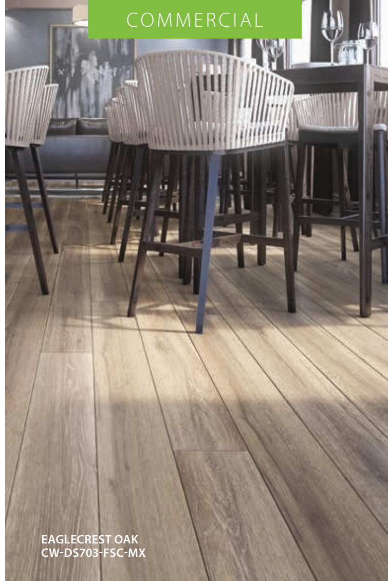
EAGLECREST OAK CW-DS703-FSC-MX