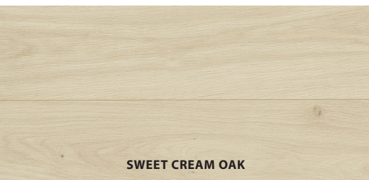
SWEET CREAM OAK