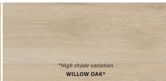
*High shade variation WILLOW OAK*