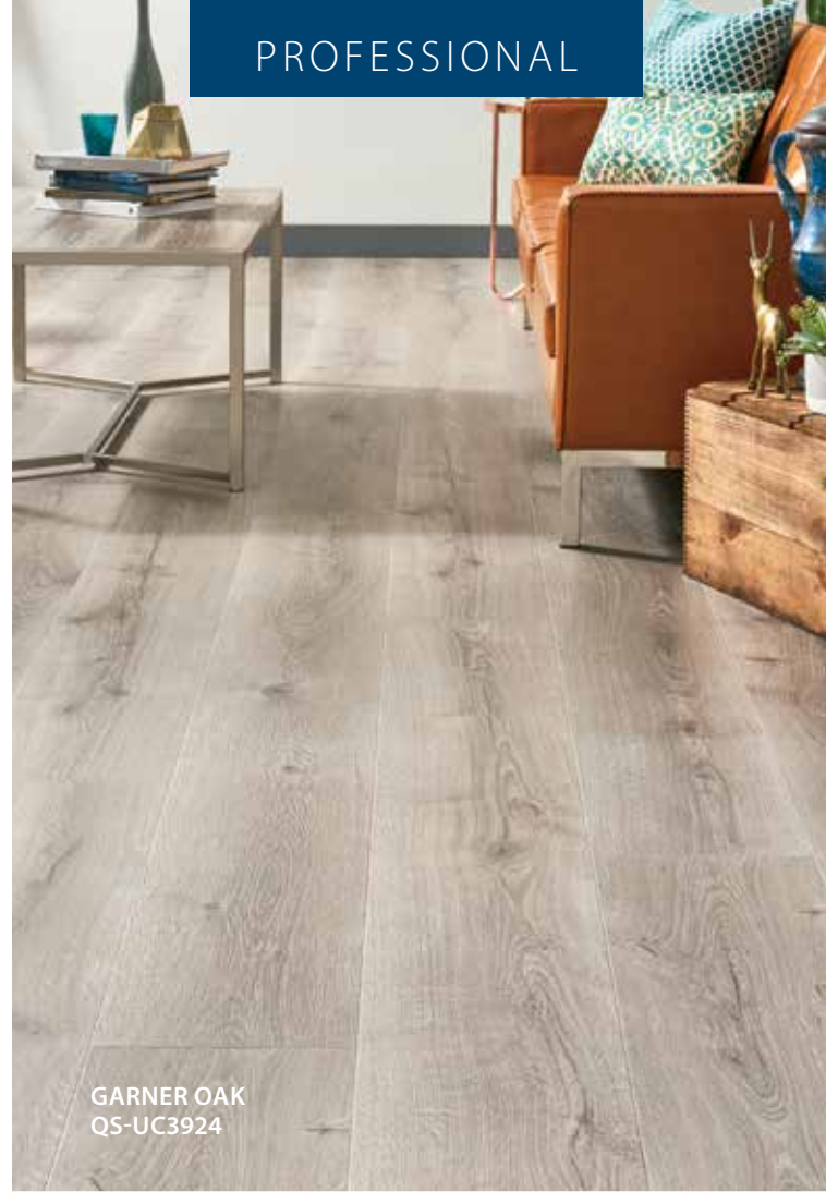
GARNER OAK QS-UC3924