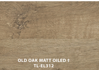
OLD OAK MATT OILED † TL-EL312

† High Shade Variation ‡ Low Shade Variation