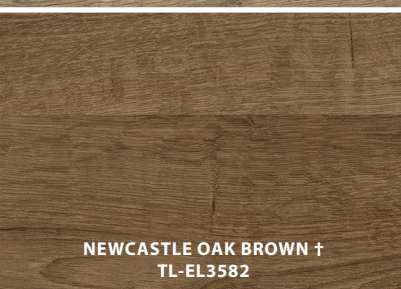
NEWCASTLE OAK BROWN † TL-EL3582