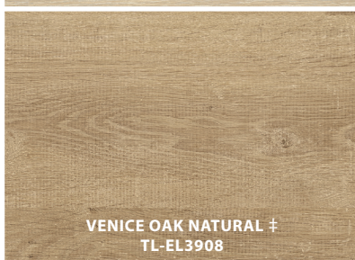
VENICE OAK NATURAL ‡ TL-EL3908