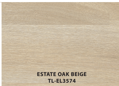
ESTATE OAK BEIGE TL-EL3574