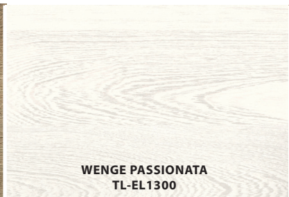
WENGE PASSIONATA TL-EL1300