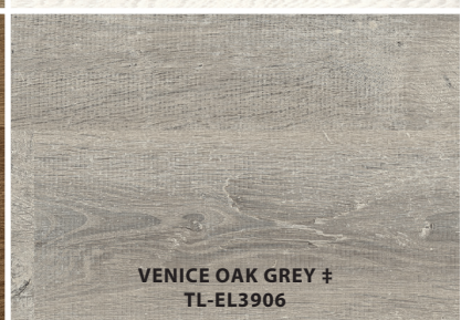
VENICE OAK GREY ‡ TL-EL3906