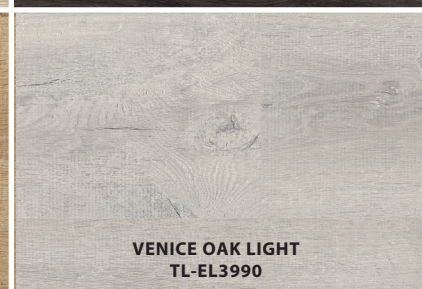
VENICE OAK LIGHT TL-EL3990