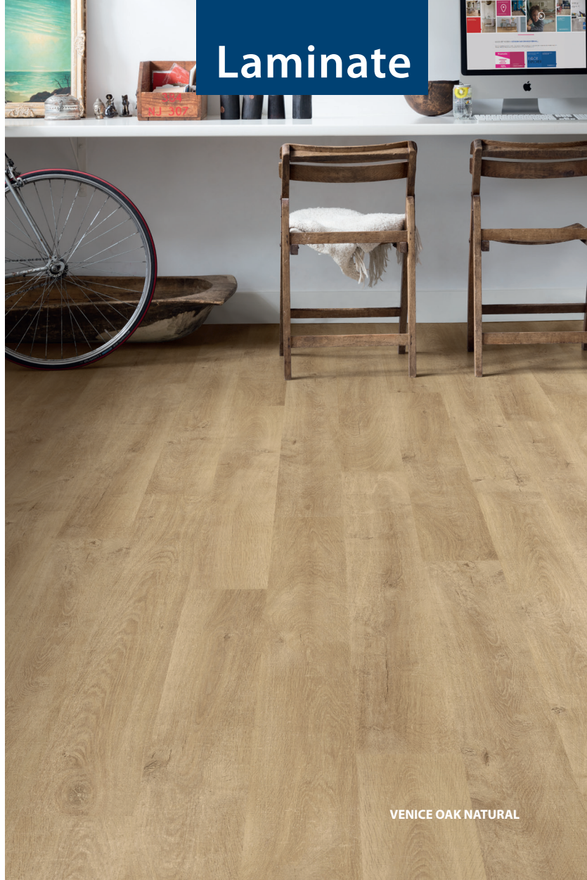
VENICE OAK NATURAL