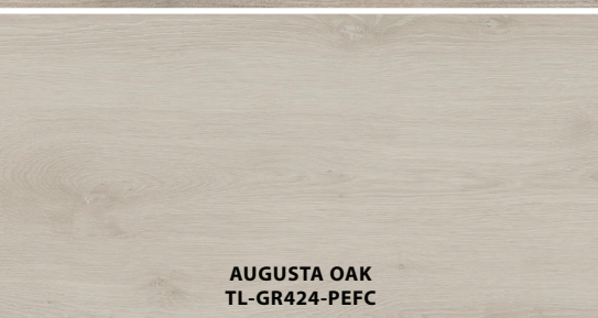
AUGUSTA OAK TL-GR424-PEFC