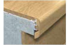
Flush Stair Nosing*