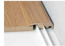
Square Nose Edge Moulding