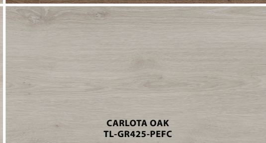
CARLOTA OAK TL-GR425-PEFC