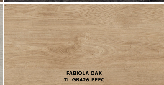
FABIOLA OAK TL-GR426-PEFC