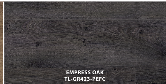
EMPRESS OAK TL-GR423-PEFC