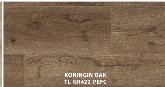
KONINGIN OAK TL-GR422-PEFC