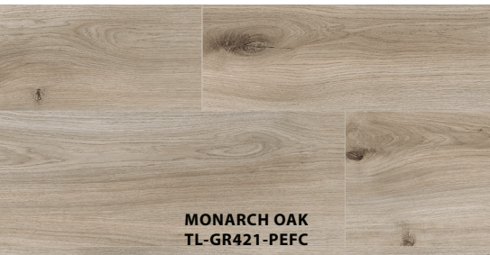
MONARCH OAK TL-GR421-PEFC