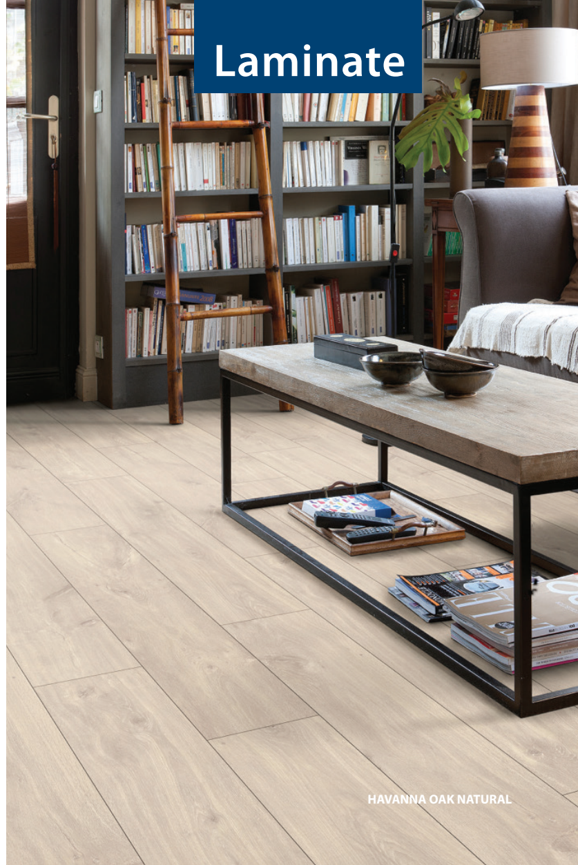
HAVANNA OAK NATURAL