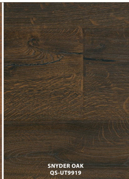
SNYDER OAK QS-UT9919