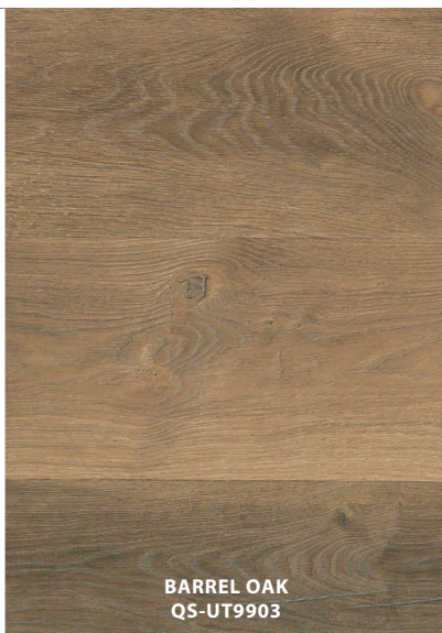
BARREL OAK QS-UT9903