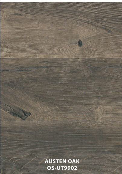
AUSTEN OAK QS-UT9902