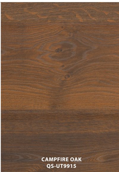
CAMPFIRE OAK QS-UT9915