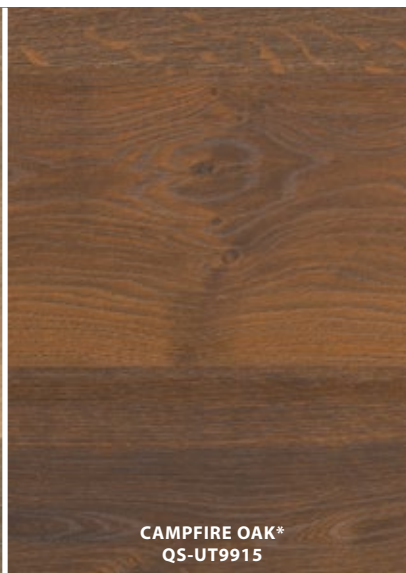
CAMPFIRE OAK* QS-UT9915