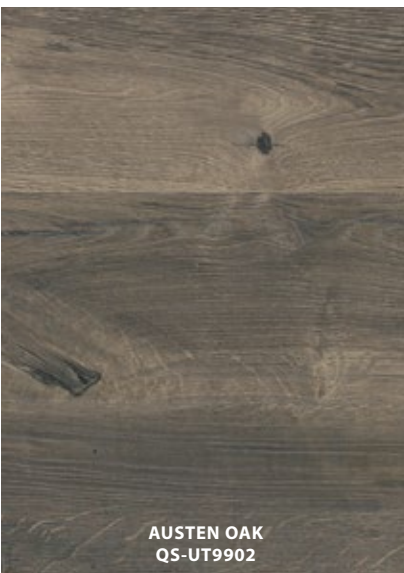
AUSTEN OAK QS-UT9902