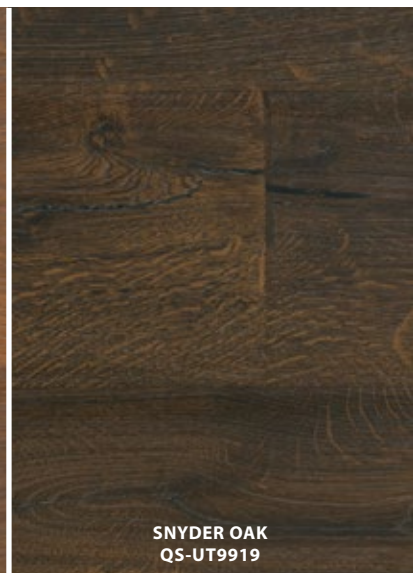
SNYDER OAK QS-UT9919