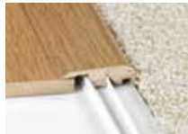
Square Nose to Carpet