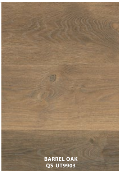
BARREL OAK QS-UT9903