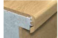
Flush Stair Nosing*

*An aluminum sub-base is required for the Flush Stair Nosing installations. Incizo can also be used for non-flush.