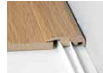
Square Nose Edge Moulding