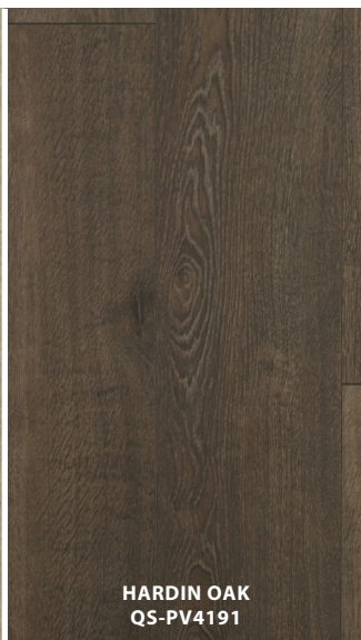
HARDIN OAK QS-PV4191