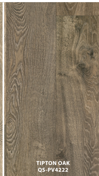
TIPTON OAK QS-PV4222