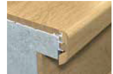
Flush Stair Nosing*

*An aluminum sub-base is required for the Flush Stair Nosing installations. Incizo can also be used for non-flush.