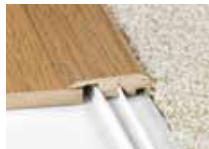
Square Nose to Carpet