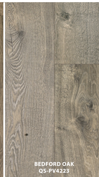
BEDFORD OAK QS-PV4223