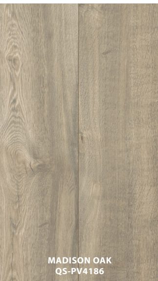
MADISON OAK QS-PV4186