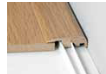
Square Nose Edge Moulding