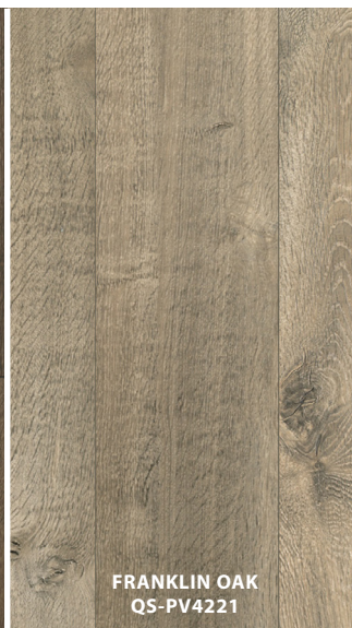
FRANKLIN OAK QS-PV4221