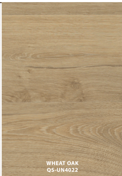
WHEAT OAK QS-UN4022