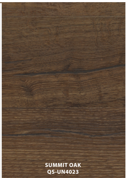
SUMMIT OAK QS-UN4023