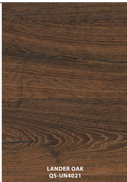
LANDER OAK QS-UN4021