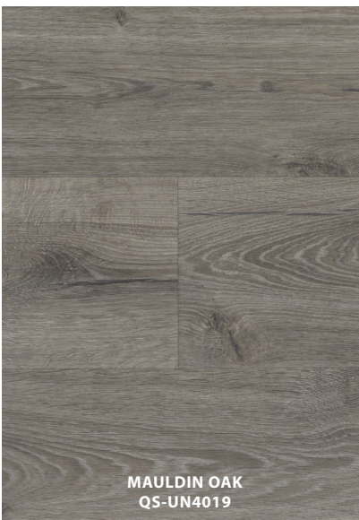
MAULDIN OAK QS-UN4019