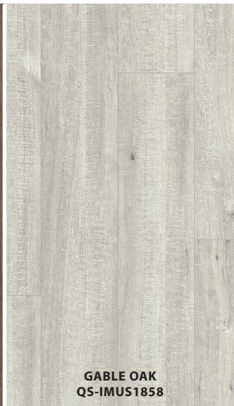
GABLE OAK QS-IMUS1858