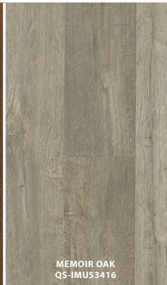
MEMOIR OAK QS-IMUS3416