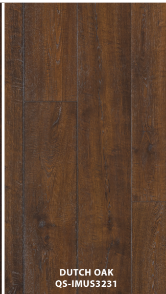
DUTCH OAK QS-IMUS3231