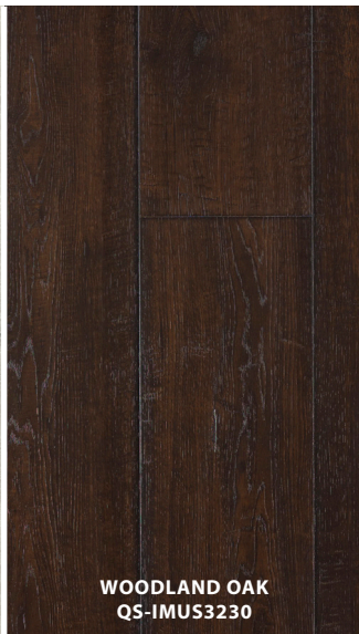
WOODLAND OAK QS-IMUS3230