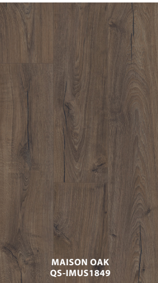
MAISON OAK QS-IMUS1849