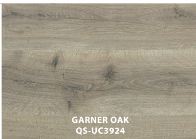
GARNER OAK QS-UC3924