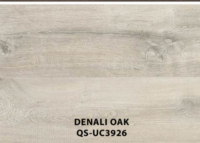
DENALI OAK QS-UC3926