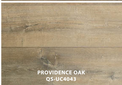
PROVIDENCE OAK QS-UC4043