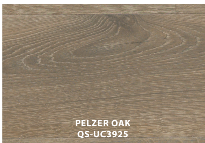
PELZER OAK QS-UC3925