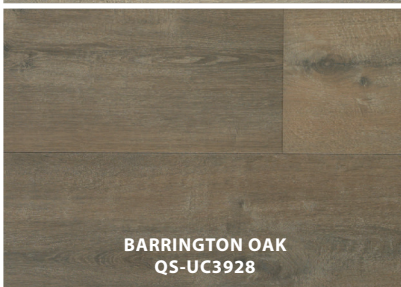
BARRINGTON OAK QS-UC3928