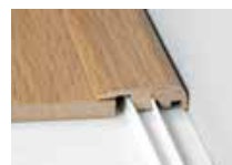
Square Nose Edge Moulding