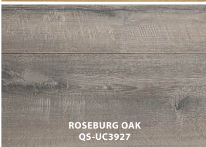
ROSEBURG OAK QS-UC3927