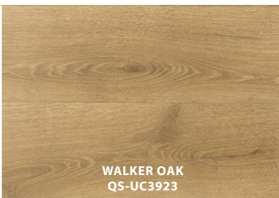
WALKER OAK QS-UC3923