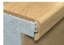
Flush Stair Nosing*

*An aluminum sub-base is required for the Flush Stair Nosing installations. Incizo can also be used for non-flush.