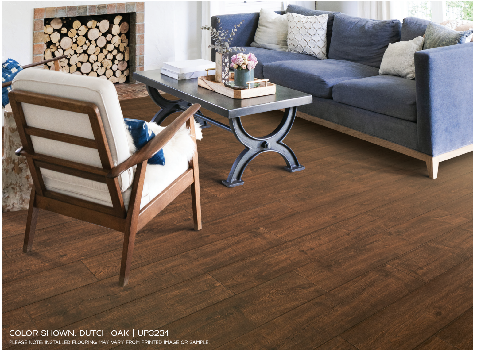
COLOR SHOWN: DUTCH OAK | UP3231

PLEASE NOTE: INSTALLED FLOORING MAY VARY FROM PRINTED IMAGE OR SAMPLE.