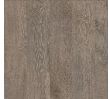
HELEN OAK UP5889