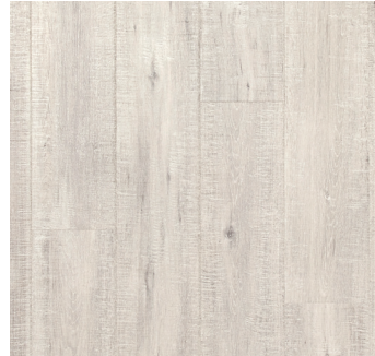
GABLE OAK UP1858