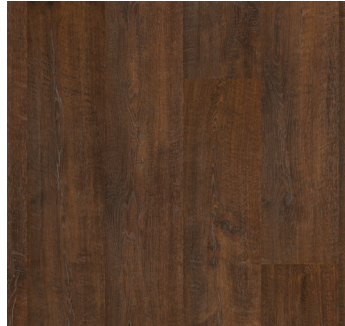
DUTCH OAK UP3231