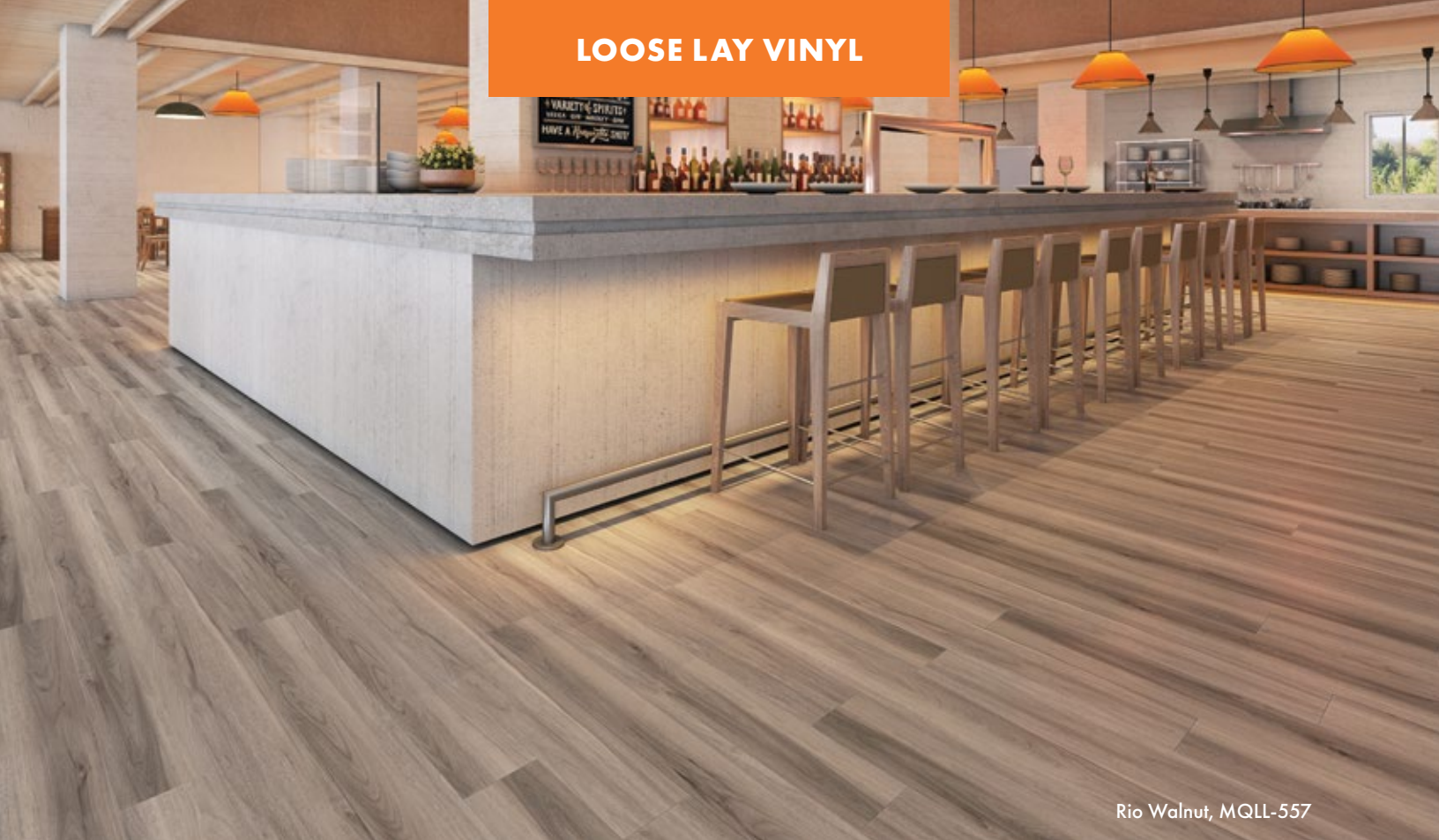
Rio Walnut, MQLL-557