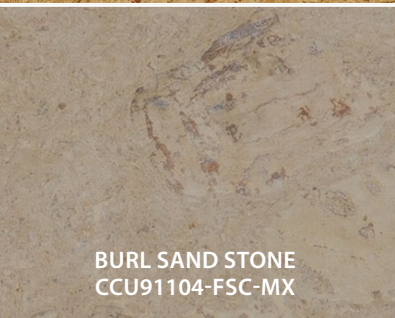
BURL SAND STONE CCU91104-FSC-MX