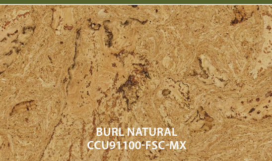
BURL NATURAL CCU91100-FSC-MX

30-Year Limited Residential Warranty for Wear and a lifetime Structural/Joint Integrity Warranty. Visit torlys.com for details.