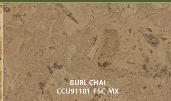
BURL CHAI CCU91101-FSC-MX