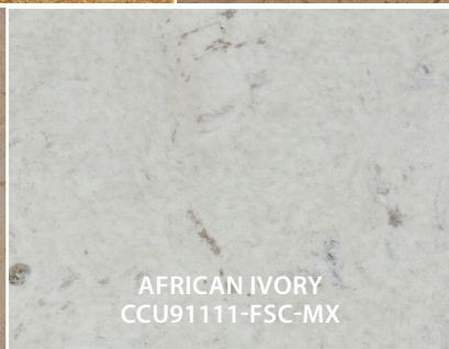
AFRICAN IVORY CCU91111-FSC-MX