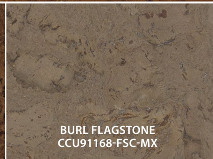
BURL FLAGSTONE CCU91168-FSC-MX